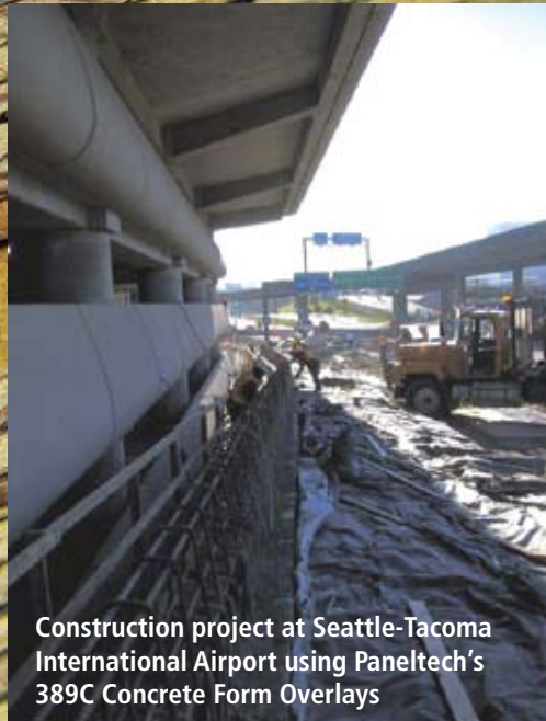
Construction project at Seattle-Tacoma International Airport using Paneltech's 389C Concrete Form Overlays