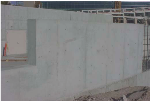
Salt Lake City Library

HDO 173C bonds well to an MDO cushion sheet as well as commonly used wood substrates. HDO 173C has been fully APA certified for concrete forming and has undergone extensive field testing. 173C exceeds the requirements of the PS 1-07 Voluntary Product Standard.